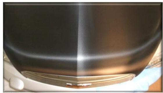
Figure 2. Damaged Film vs. Undamaged Film Post-Installation